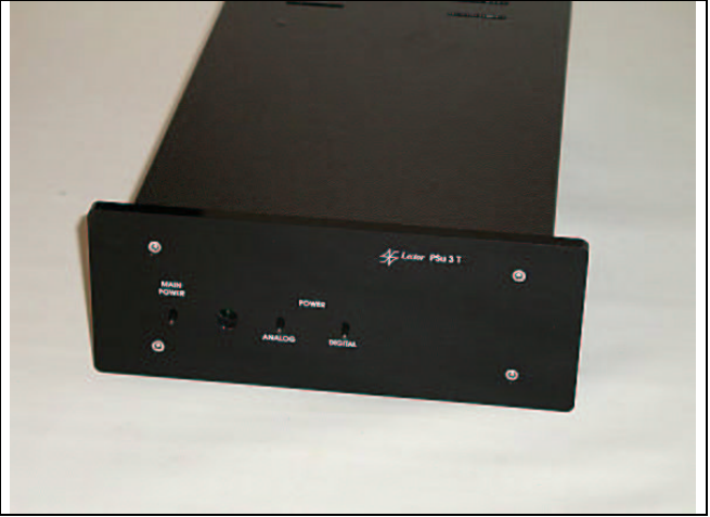
CDP-7 with dedicated power supply