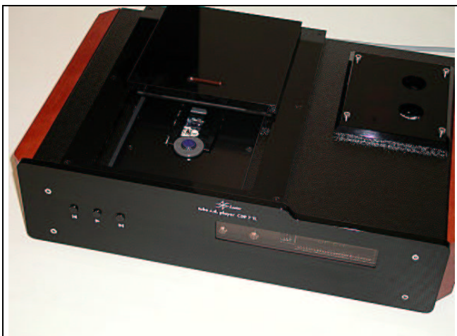
Base unit cdp-7 with slider door open Ready to accept a compact disc